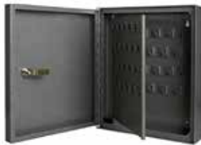
Telkee Key Cabinet 60 Key Capacity, Grey