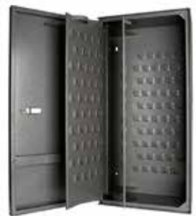
Telkee Key Cabinet 250 Key Capacity, Grey