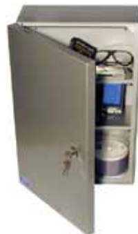
Telkee Adjustable Shelf Lockable Cabinet, Grey