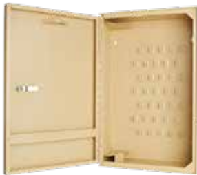
Telkee Key Cabinet 100 Key Capacity, Beige

Telkee's commercial quality lockable key management cabinets are made with 1mm - 1.6mm steel, are wall mountable, and have a powder coated finish. Cabinets can hold 35 to 550+ sets of keys. Telkee's range also include adjustable shelf cabinets, filing cabinet key storage systems and workplace health and safety storage cabinets.