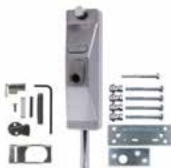
ADI Lock Bolt 5004 SC Less Barrel Sub Assembled