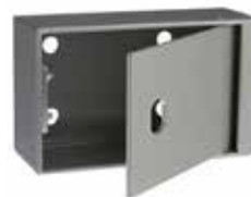
Key Box Hinged with Less Cam Lock NMB1112CAMLC