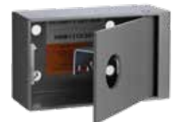
Key Box Hinged Suit MT5-201 Cylinder NMB1112MT5LC