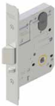
Primary Mortice Lock MS2600 Series

Their high-quality portfolio encompasses secure access solutions to suit hotels, shops, sports facilities, airports, hospitals, residential spaces and offices. This selection of top performing dormakaba products has become a staple of the security industry.