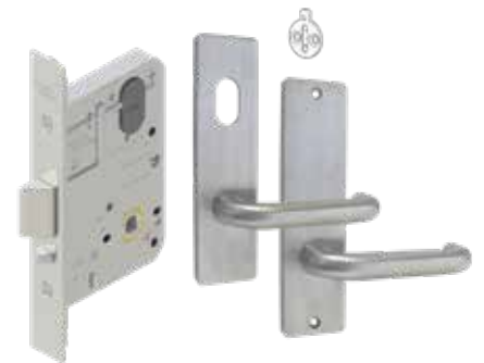
MS2 Classroom Lock Kit 600 Series