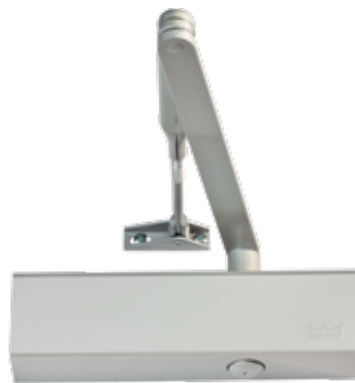
TS73 EN1-4 Door Closer DOTS7300SIL