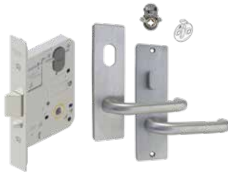
Entrance Lock Kit 600 Series