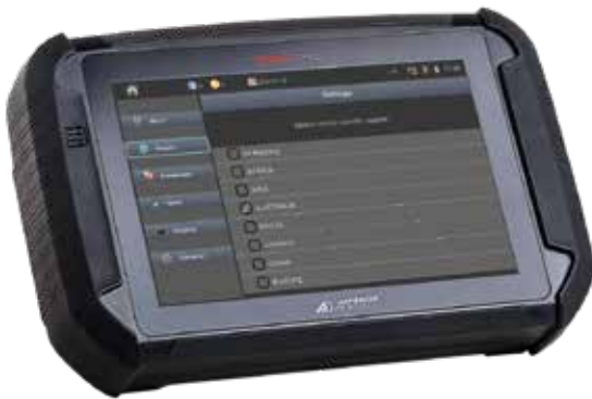
Select region in the Settings Menu to lock the region.

The SMART Pro menu has 17 geographical regions listed. These regions can be filtered as required by the end user. It is recommended that Australia only is selected. This declutters and streamlines the vehicle model listing for our region only. Importantly the Australian vehicle menu listings have been designed by LSC, so the highest degree of accuracy is maintained.