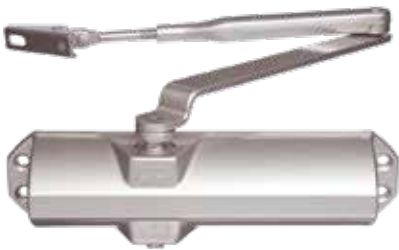
TS68 EN2-4 Door Closer DOTS6800SIL

Whether for private homes or contemporary office buildings, door closer systems from dormakaba are intelligent, integrated access solutions that combine consistency, convenience, design and premium quality. The wide-ranging product portfolio satisfies a broad spectrum of functional requirements and thus offers solutions for almost any individual door situation.