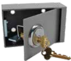
Key Box Hinged with 201 Cylinder NMB1112201