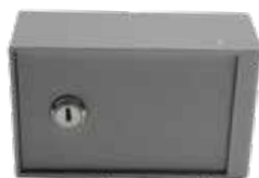
Key Box Hinged with Cam Lock NMB1112CAM