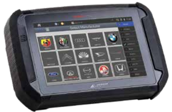
Select, add or remove region in the Vehicle Manufacturer section for the current session only