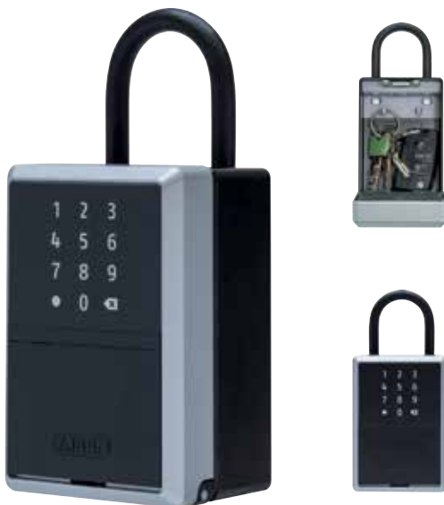
ABUS KEYGARAGE™ KG787 shown with the optional shackle KG787BTSHKL (sold separately)