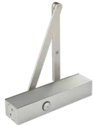
TS83 EN3-6 Door Closer DOTS8300SIL