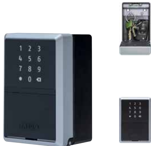
ABUS KEYGARAGE™ KG787 SMART - BLUETOOTH with mount DP (Box)

For additional security, you can monitor who accesses the KeyGarage with notifications as well as an audit trail all through the app.