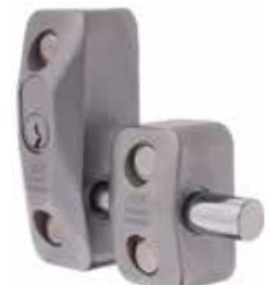
ADI BLOCKLOK 444DDFM Double Front Mount, Satin Chrome ADI444DDFMSC