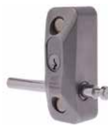
ADI BLOCKLOK 444FM Single Front Mount, Satin Chrome ADI444FMSC