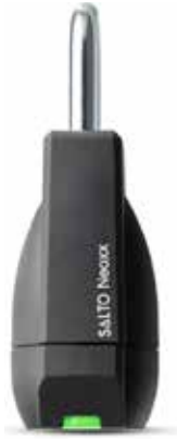
SALTO BLE Neox Padlock without Chain NBP4P60150CPB0

Built to withstand every application, tested and approved, the SALTO Neox G4 is a padlock you can rely on when you're out in the field in any type of application. Robust and durable, this electronic padlock features IP68 water resistance and dust protection for harsh environments and extreme climates, to shield it from the elements.