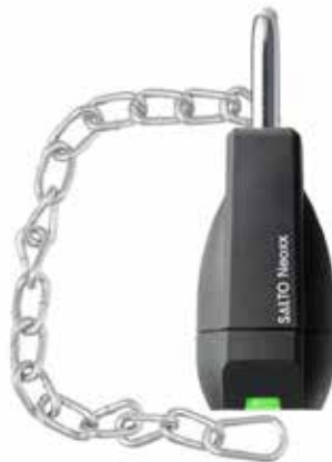
SALTO BLE Neox Padlock with Chain NBP4P60150CPB1