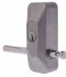
ADI BLOCKLOK 444 Single, Satin Chrome ADI444RMSC