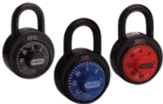
ABUS 78 SERIES COMBINATION PADLOCKS

LSC stock the most comprehensive range of ABUS Combination padlocks in New Zealand. If you're after a school locker padlock, travel combination padlock, colourful aluminium body, quality brass body or something heavier duty, ABUS have a padlock to suit everyone's need. Great for securing lockers, gates, suitcases, toolboxes & cupboards. With over 60 products to choose from, it's no wonder more security professionals are choosing ABUS combination padlocks.