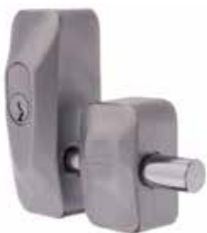
ADI BLOCKLOK 444DD Double, Satin Chrome ADI444DDSC