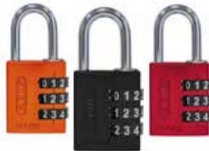
ABUS 144 SERIES COMBINATION PADLOCKS