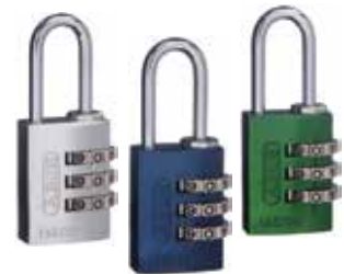
ABUS 145 SERIES COMBINATION PADLOCKS