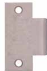
BDS Strike Standard suit 3572 Offset Top & Bottom SSS 11351172

fit a blank strike, no filler, no painting