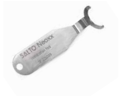
SALTO NEOXX Padlock Removable Tool SP226009