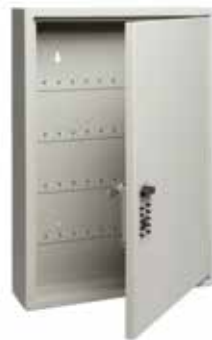
KIDDE Touchpoint Key Cabinet 60 Key Capacity 001796