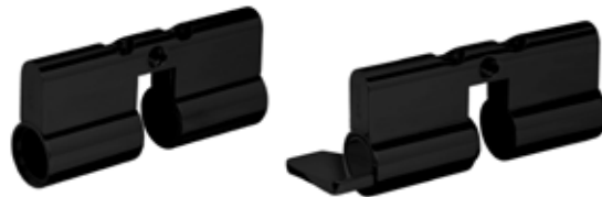
BRAVA Metro Cylinder 9555-1 Matt Black Double Cylinder Fixed Cam *No Barrel* BRM95551NBMB