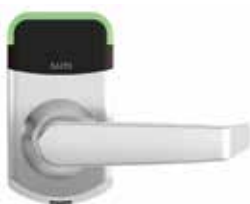
XS4 MINI - ANSI