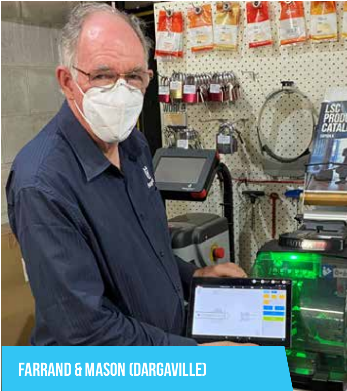
FARRAND & MASON (DARGAVILLE)