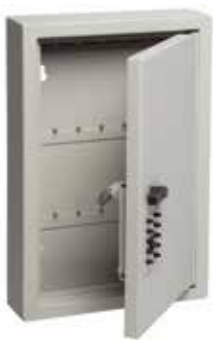
KIDDE Touchpoint Key Cabinet 30 Key Capacity 001795