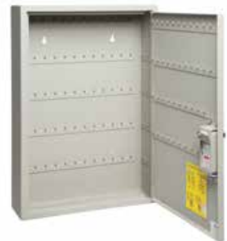
KIDDE Touchpoint Key Cabinet 120 Key Capacity 001797