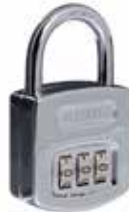
ABUS 160 SERIES COMBINATION PADLOCKS